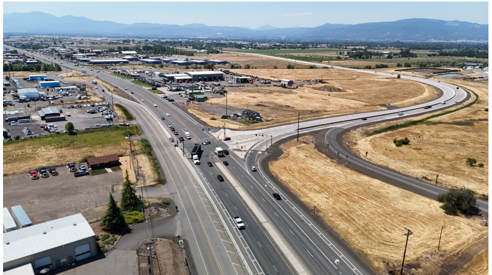
OR 62 Expressway/Crater Lake Highway intersection

The Oregon Department of Transportation (ODOT) and Jackson County are partnering to plan for the future of Oregon Highway 62 — also known as OR 62 or Crater Lake Highway. This planning effort focuses on the area in and around the White City community.